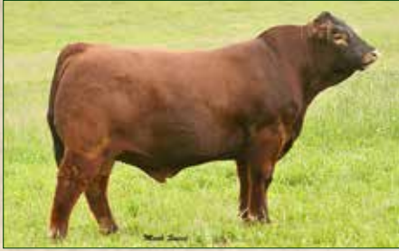
Tri-N Captain Morgan 418B