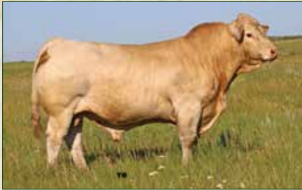
Tri-N Enforcer 649D