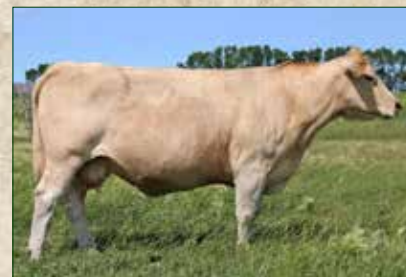
Dam - Tri-N Prairie Rose 401P

Dam is the highest milk EPD female in the History of the Canadian Charolais Association. The genetics that created our cow herd.