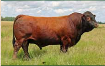
Tri-N Captian Morgan 340A