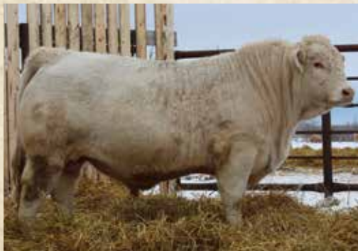
Jehu on Sale day at 2 years of age

As we see this bull age, we love him more and more. Jehu will have a lasting impact on our herd for the years to come. We are excited to offer his progeny to you!