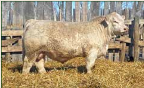
2426H on video day!