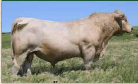
Sire - SCX Thriller 89B

Jackson 1004G sold in our 2020 bull sale for $7000. The buyer failed to oblige to his financial obligations so here he is. We used this bull on a select group of purebred and commercial cows this spring.