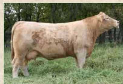
Full Sister - Tri-N Prairie Rosebud 37S